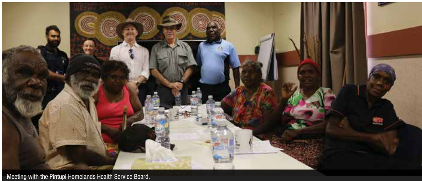
Meeting with the Pintupi Homelands Health Service Board.

The clinic has four doctors, nurses, and visiting endocrinologists, cardiologists, podiatrists, obstetrician/gynaecologists, dieticians and dentists.