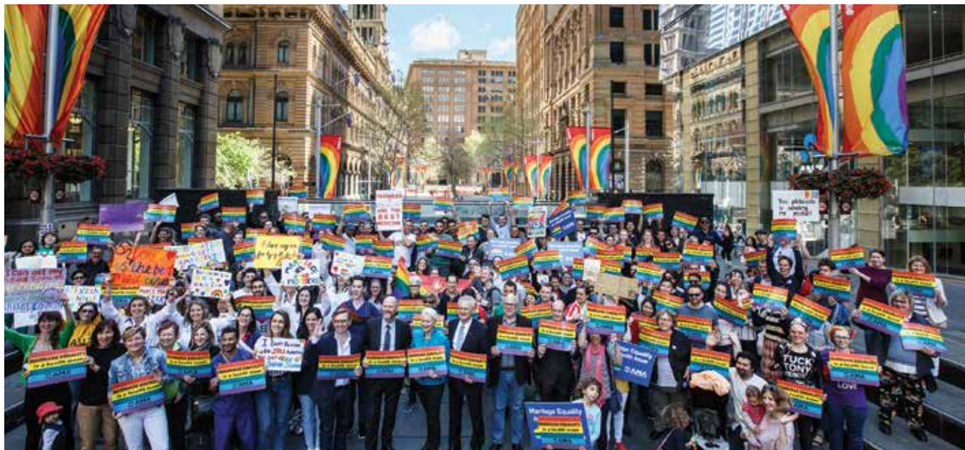
Doctors and medical students rally in Sydney in support of marriage equality.